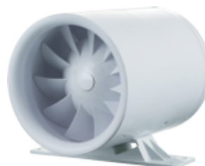
Ducto-U – fan with a fixing bracket for flat surface mounting